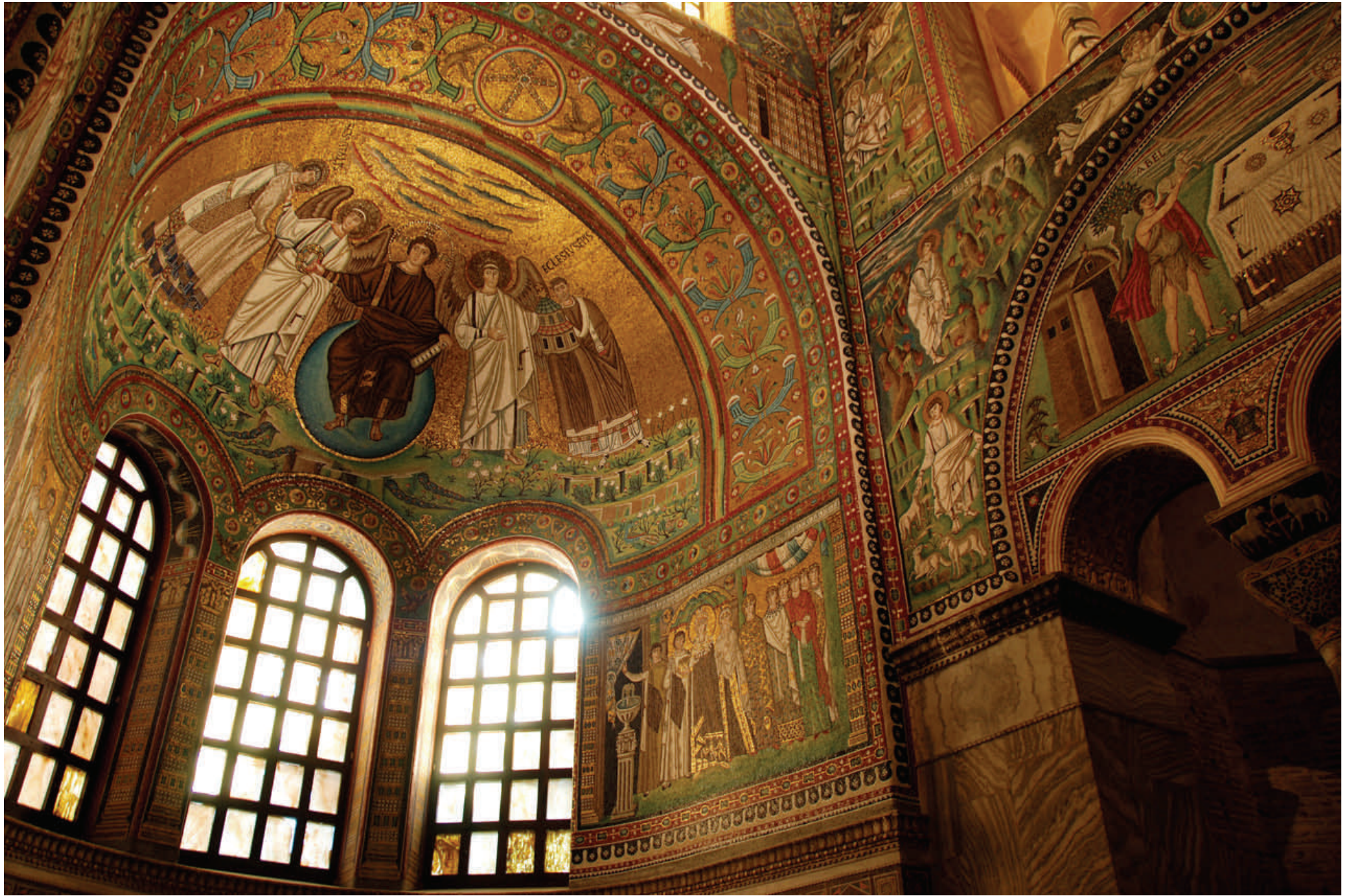
Mosaic of the Incarnate Logos at San Vitale, Ravenna