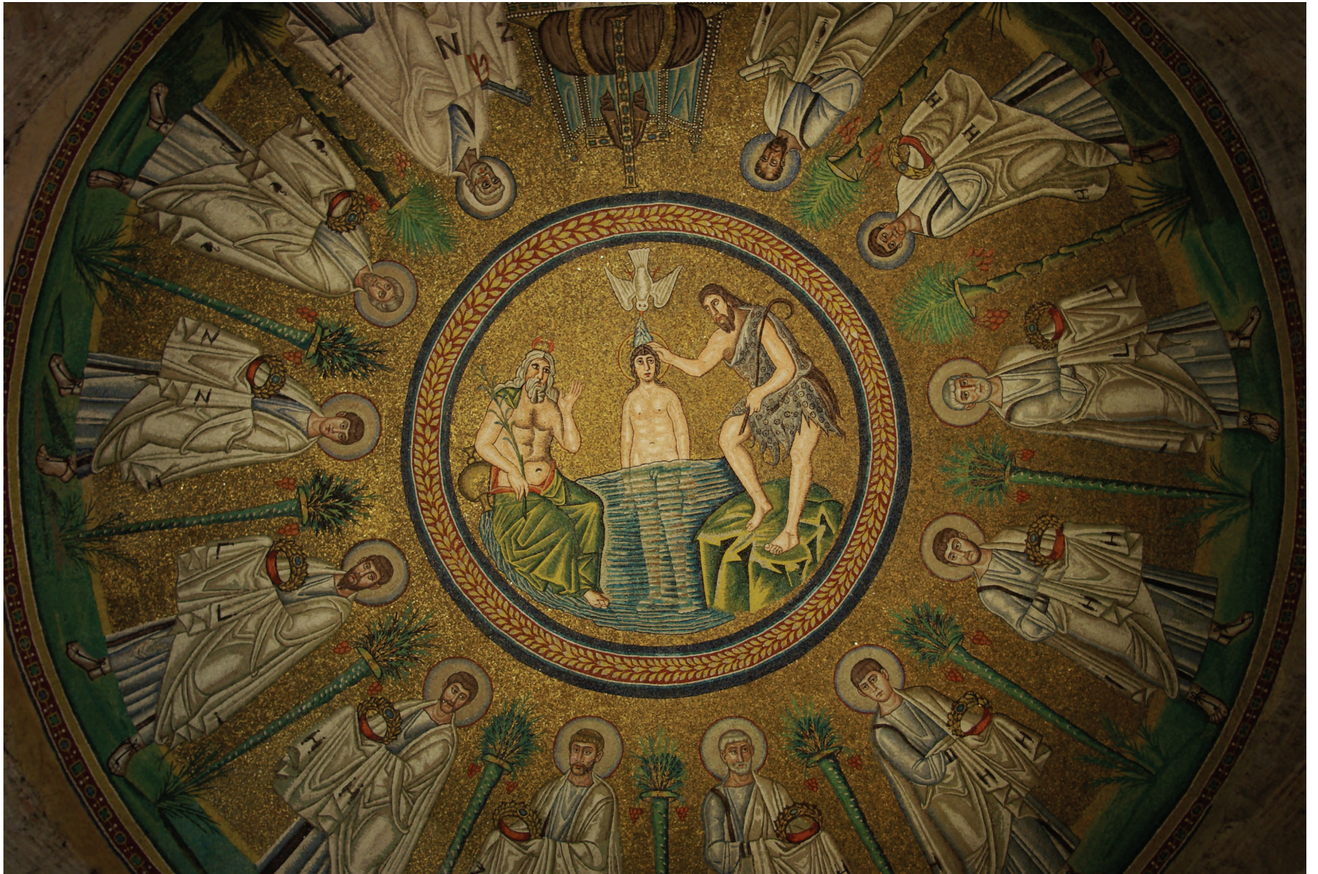
Mosaic of the Baptism of Christ at the Arian Baptistery in Ravenna