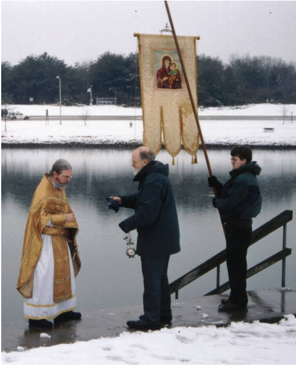
Ice and snow are no obstacles!