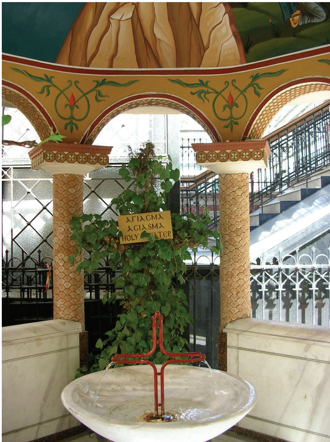
Right: A fountain of holy water at Thessaloniki