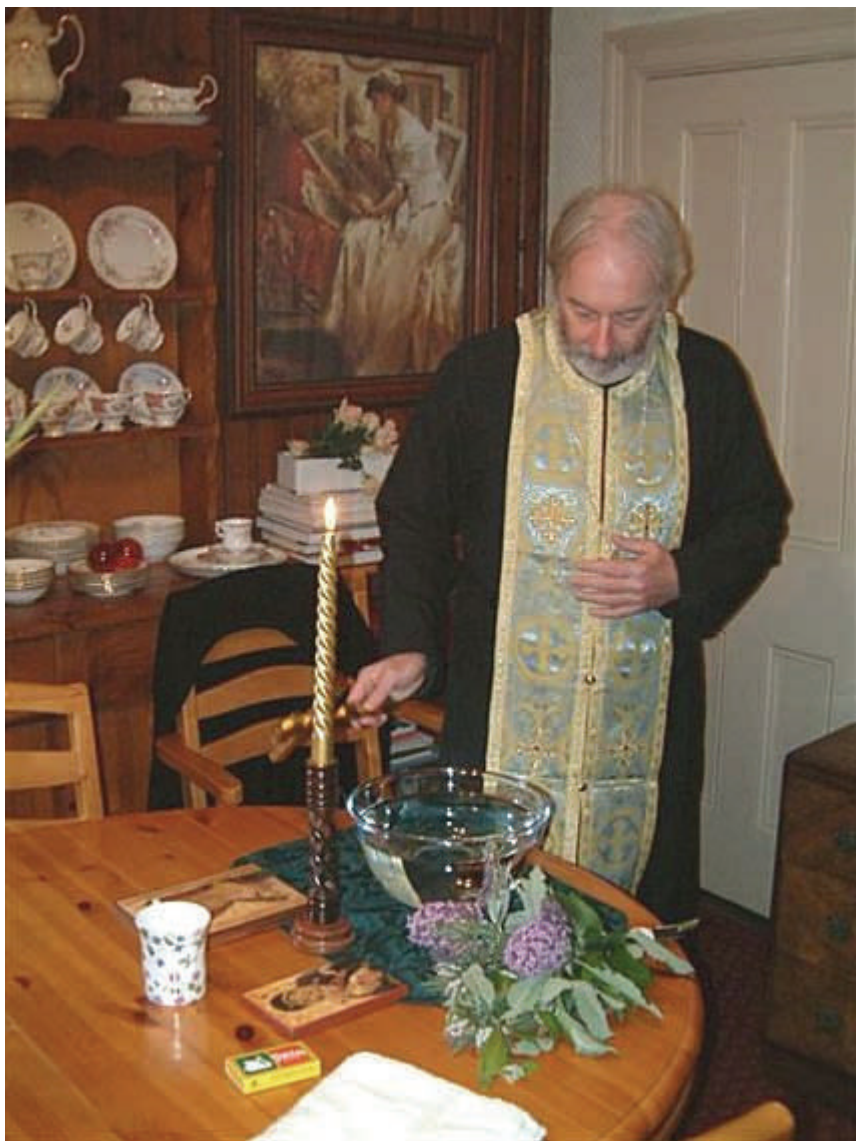
Above: A house blessing