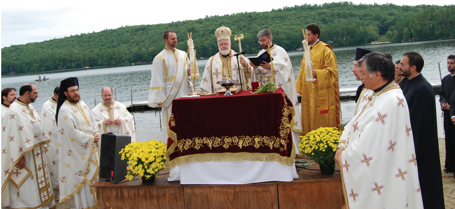
The Blessing of Waters at the Metropolis Camp in New Hampshire