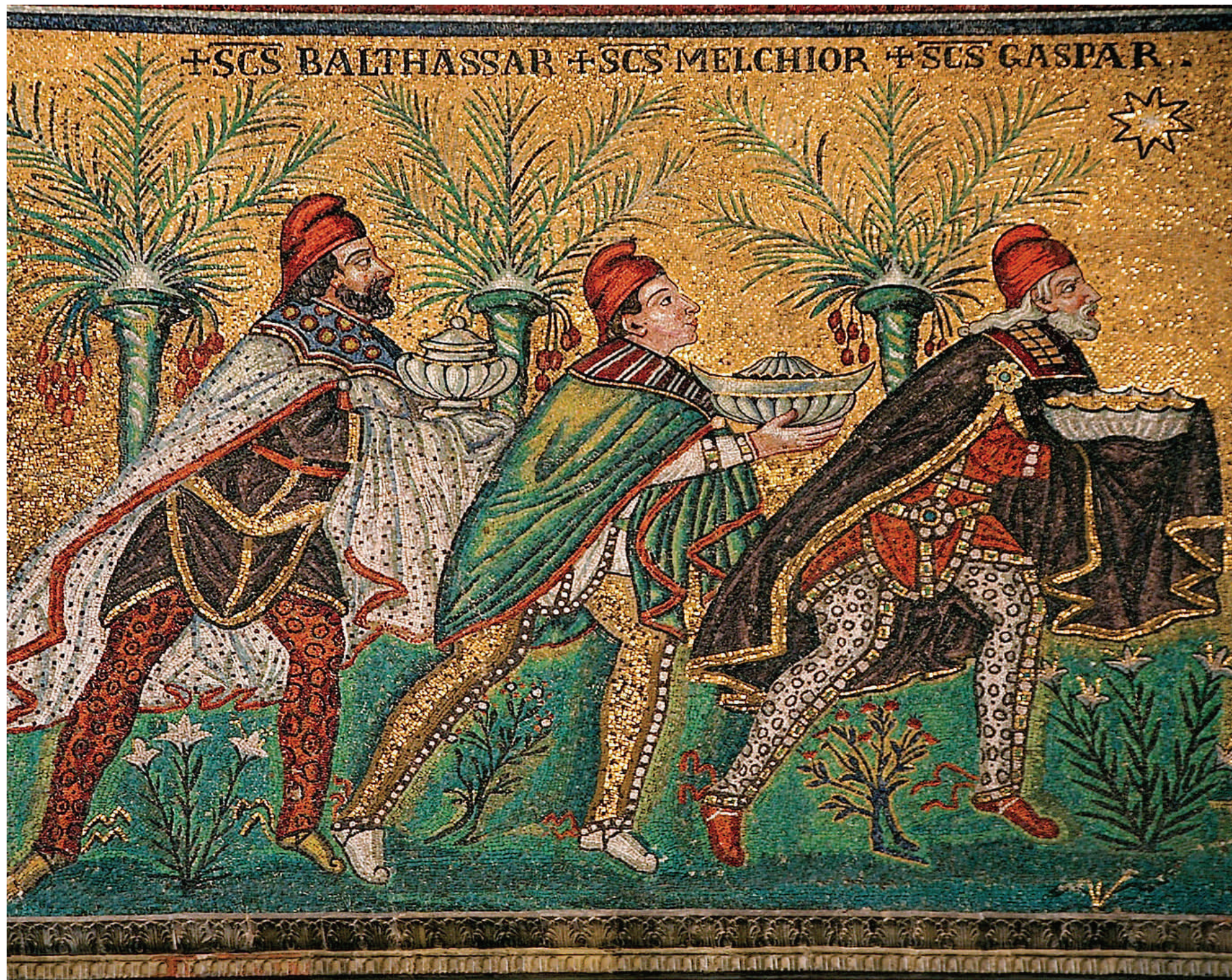
The Magi at San Apollinare Nuovo, Ravenna