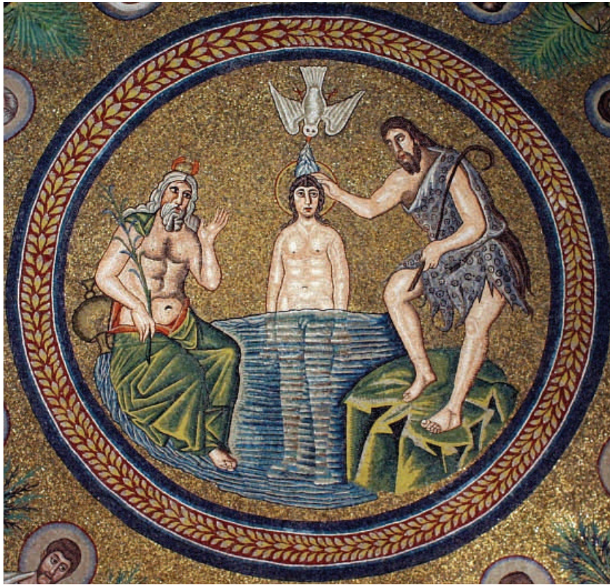
Two mosaics of the Baptism of Christ from Ravenna, Italy

The one on the left is from the Arian Baptistery (late 5th century), built by Theodoric, a Goth who ruled Ravenna at the time and who subscribed to the Arian faith, which had been declared heretical at the Council of Nicaea in 325 AD.